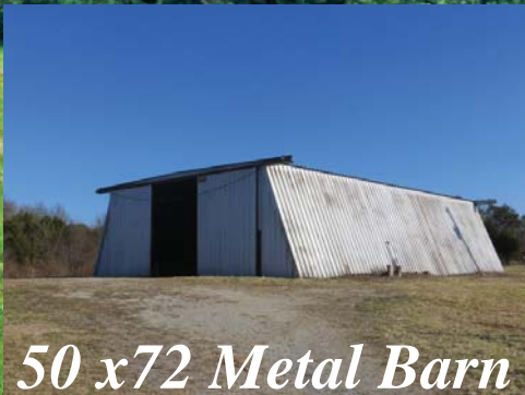
50 x72 Metal Barn