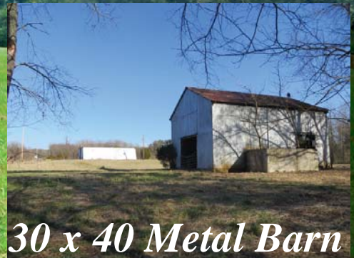
30 x 40 Metal Barn

Open House: Friday, May 16th 5-7pm or anytime by appointment.